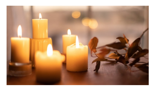
A Time to Remember