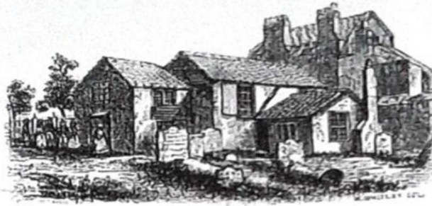
Old Chapel, Hoddesdon.