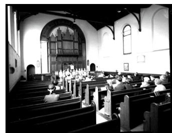
Inside the Hoddesdon Chapel

Please turn to page 3 to read Mrs Ellis's verses about raising the money for the new Chapel.